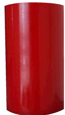
Ballistic Media Core