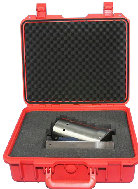
Transport Storage Options