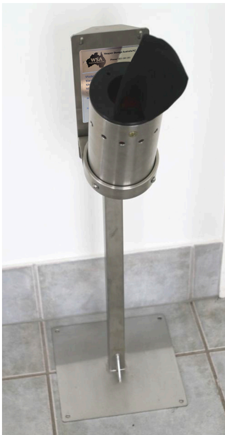
Fixed Pedestal (Bolt Down)