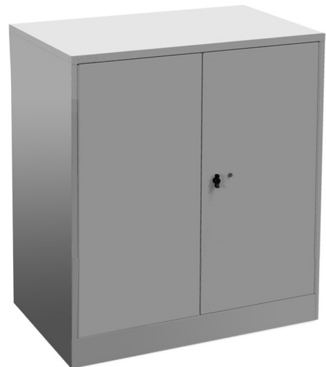
Enclosed Cabinet with Security doors and Abloy Lock